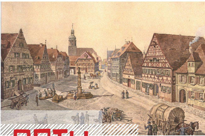
Market place, Friedrich Trost, 1913