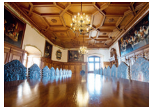
Dining hall Ratibor castle

Beginning in 1535, the Margraves from Ansbach (the rulers of the region) erected the