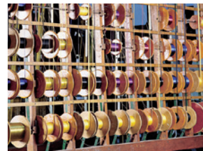
Museum of the Leonian Industry

After the last Margrave resigned in 1791, Prussia took over the principality. In 1806 it became part of the Kingdom of Bavaria.